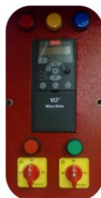
Speed Control Micro Drive